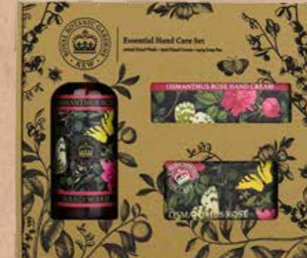
Osmanthus Rose KGLGB016

A floral fragrance with top notes of lime, bergamot and pear. Notes from jasmine, orange blossom, tuberose and narcissus form the heart of the scent and come together on a base of vanilla and sandalwood.