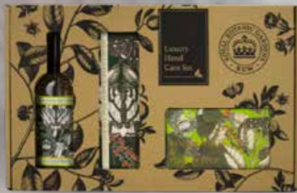
Sandalwood & Pink Pepper KGGB005