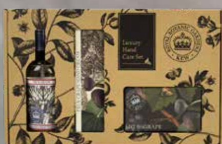
Fig & Grape KGGB010