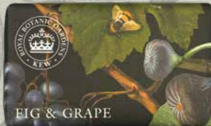
Fig & Grape KGS0010