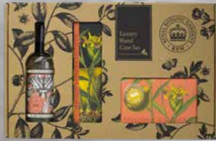
Bergamot & Ginger KGGB008