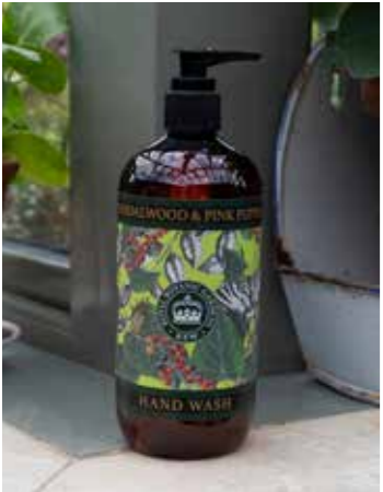
Sandalwood & Pink Pepper KGL0005