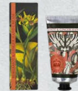
Bergamot & Ginger KGHC0008 **AVAILABLE TO ORDER**