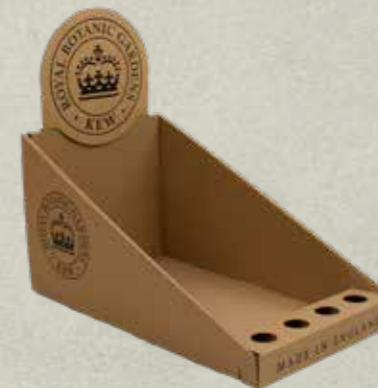
CDU2 HAND CREAM CDU HOLDS 4 CASES