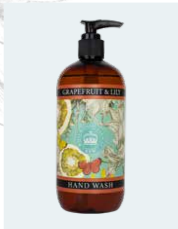
Grapefruit & Lily KGL0003