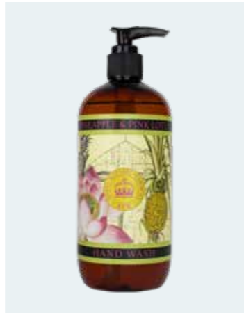
Pineapple & Pink Lotus KGL0014