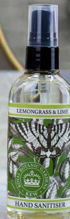
Lemongrass & Lime KGA004