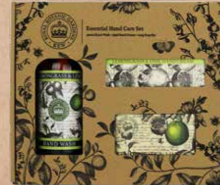
Lemongrass & Lime KGLGB004

A zesty blend of citrus combined with the freshness of lemongrass, creates a balanced and uplifting fragrance.