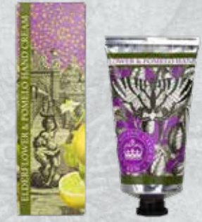
Elderflower & Pomelo KGHC0006