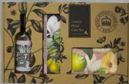
Magnolia & Pear KGGB009