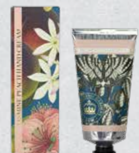
Jasmine Peach KGHC0017 **AVAILABLE TO ORDER**