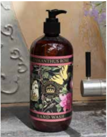
Osmanthus Rose KGL0016