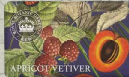
Apricot Vetiver KGS0018