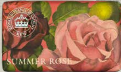
Summer Rose KGS0002