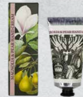
Magnolia & Pear KGHC0009 **AVAILABLE TO ORDER**