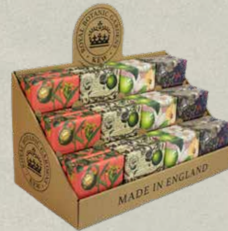
CDU3 SOAP BAR CDU HOLDS 4 CASES (24 SOAP BARS)