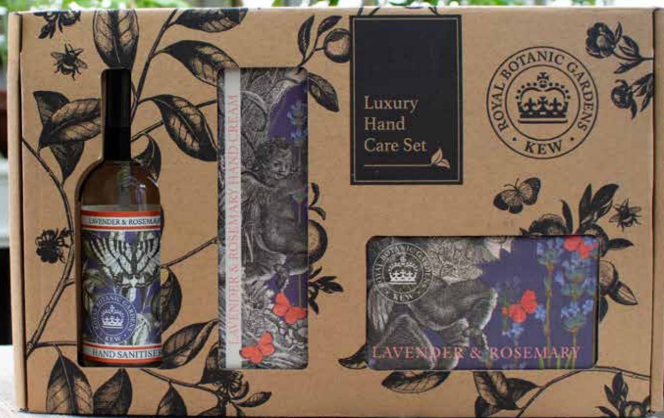
Lavender & Rosemary KGGB001