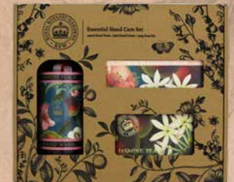
Jasmine Peach KGLGB017

A subtle and exotic floral fragrance with top notes of bergamot and peppercorn. Delicate notes of peony, apricot and osmanthus complement the warm base of musk and patchouli.