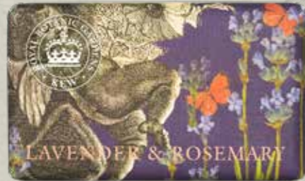
Lavender & Rosemary KGS0001