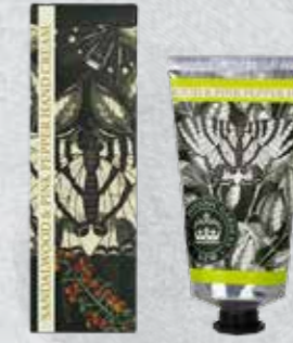
Sandalwood & Pink Pepper KGHC0005