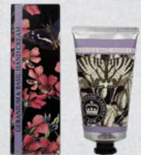
Geranium & Basil KGHC0021 **AVAILABLE TO ORDER**