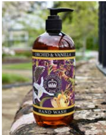
Orchid & Vanilla KGL0020 **AVAILABLE TO ORDER**