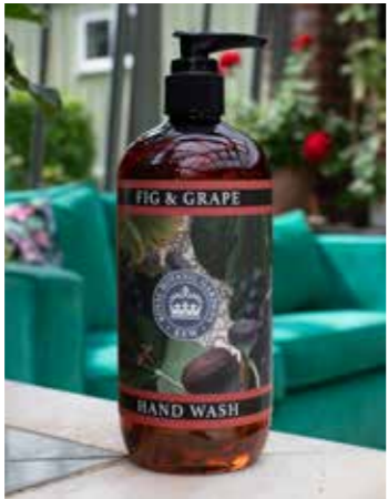
Fig & Grape KGL0010