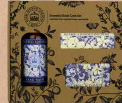
Bluebell & Jasmine KGLGB007

A meadow fresh fragrance with notes of bluebell, jasmine and hyacinth. Rose complements a soft base of musk to create this delicate fragrance.