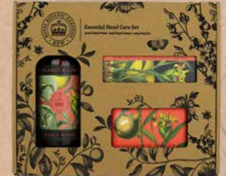
Bergamot & Ginger KGLGB008

A balance of citrus and spice evokes the scents of the Mediterranean. A floral heart of rose, complemented by a rich base of patchouli and musk.