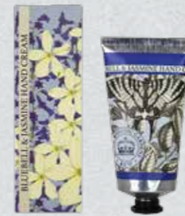
Bluebell & Jasmine KGHC0007 **AVAILABLE TO ORDER**