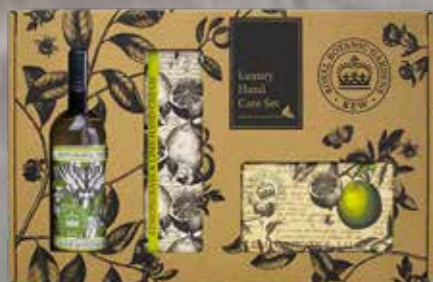
Lemongrass & Lime KGGB004