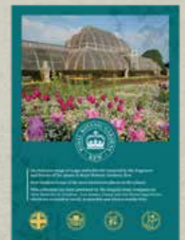
INFORMATION POSTERS A4 (POK02) OR A5 (POK03)