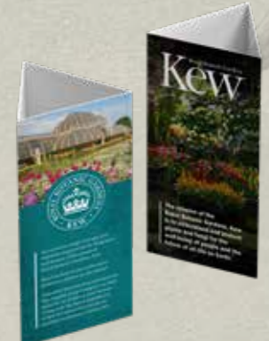
TRIANGLE TENT CARD 3 SIDED TENT CARD (POK01)