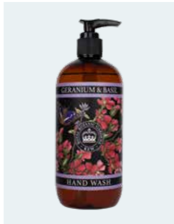
Geranium & Basil KGL0021 **AVAILABLE TO ORDER**