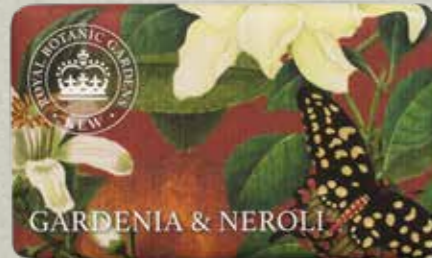
Gardenia & Neroli KGS0019