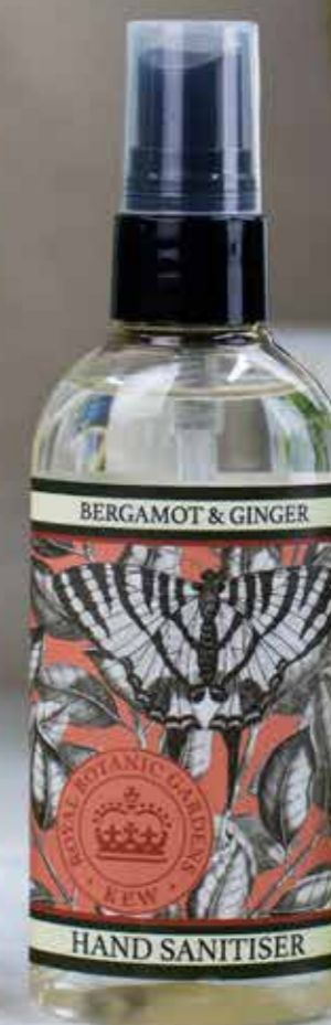
Bergamot & Ginger KGA008