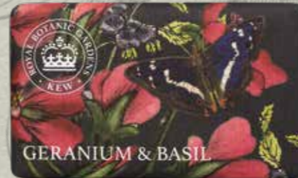
Geranium & Basil KGS0021