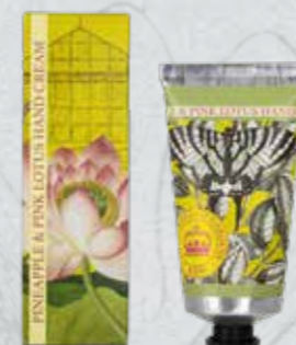
Pineapple & Pink Lotus KGHC0014