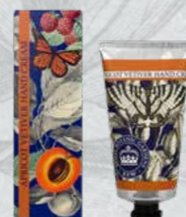
Apricot Vetiver KGHC0018 **AVAILABLE TO ORDER**