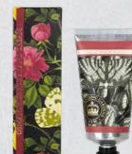
Osmanthus Rose KGHC0016