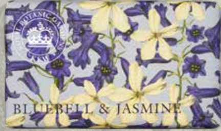
Bluebell & Jasmine KGS0007