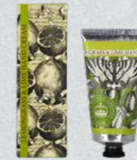
Lemongrass & Lime KGHC0004