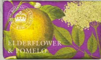
Elderflower & Pomelo KGS0006