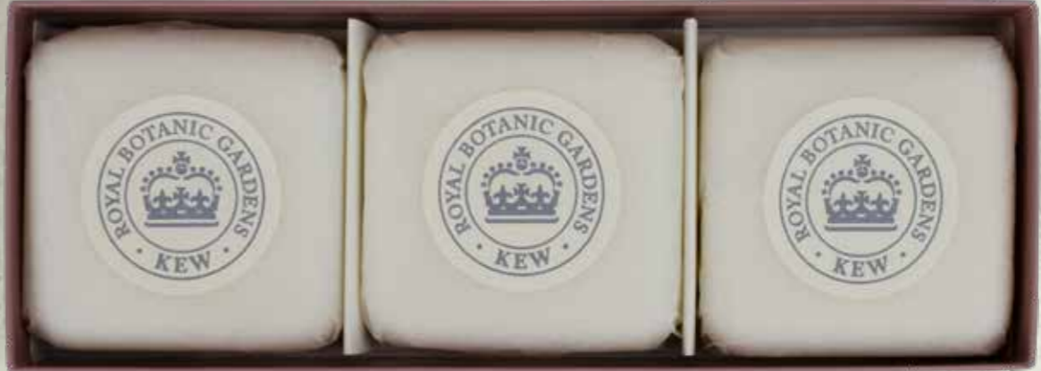
Magnolia & Pear KGTS009

Top notes of pear combine with heart notes of magnolia, orchid and freesia along with a base of amber and patchouli create this evocative scent.