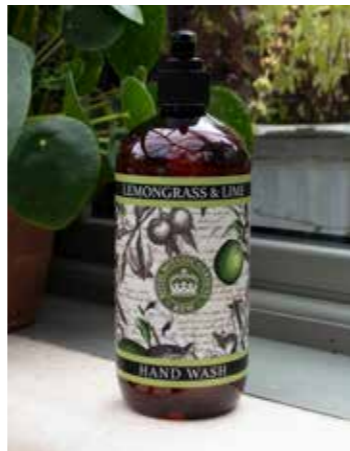
Lemongrass & Lime KGL0004 **AVAILABLE TO ORDER**