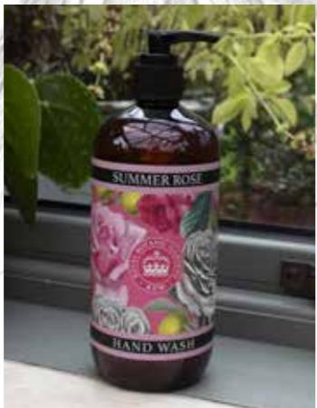
Summer Rose KGL0002