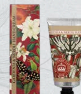
Gardenia & Neroli KGHC0019 **AVAILABLE TO ORDER**