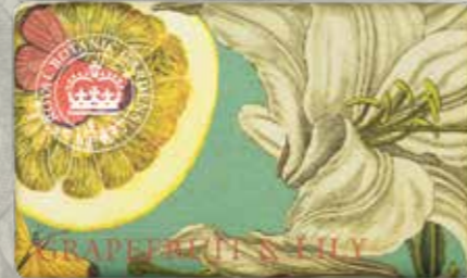
Grapefruit & Lily KGS0003