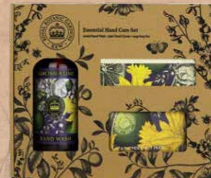
Narcissus Lime KGLGB015

A floral fragrance with top notes of lime, bergamot and pear. Notes from jasmine, orange blossom, tuberose and narcissus form the heart of the scent and come together on a base of vanilla and sandalwood.