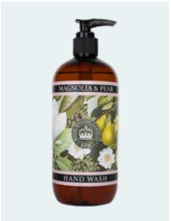
Magnolia & Pear KGL0009 **AVAILABLE TO ORDER**