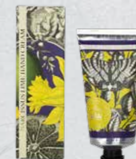
Narcissus Lime KGHC0015