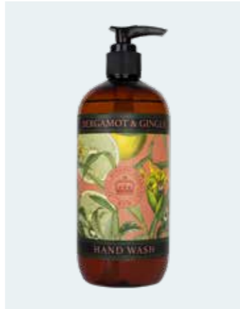
Bergamot & Ginger KGL0008 **AVAILABLE TO ORDER**