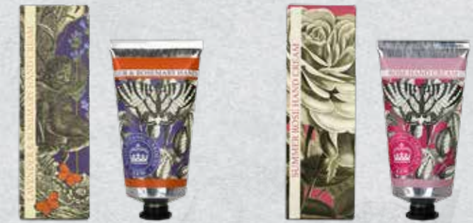
Lavender & Rosemary KGHC0001 **AVAILABLE TO ORDER**