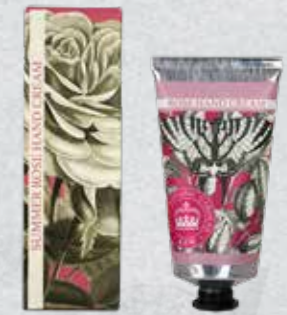
Summer Rose KGHC0002