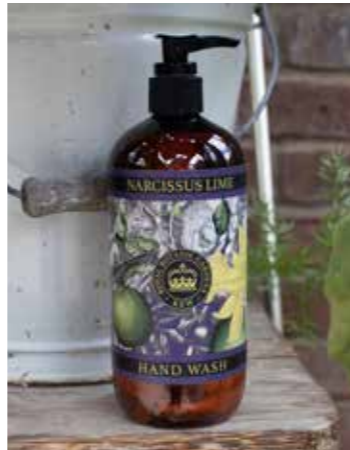
Narcissus Lime KGL0015