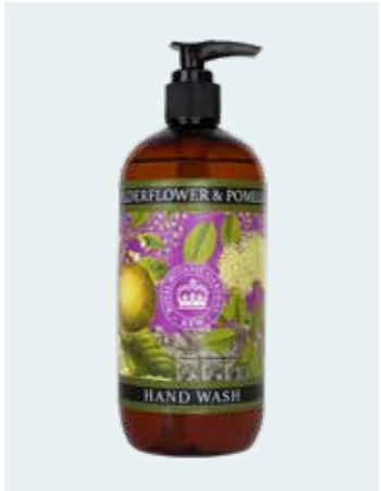
Elderflower & Pomelo KGL0006