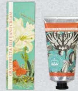
Grapefruit & Lily KGHC0003