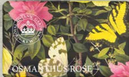
Osmathus Rose KGS0016