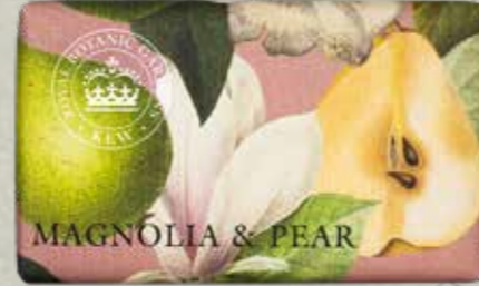
Magnolia & Pear KGS0009