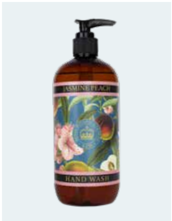
Jasmine Peach KGL0017 **AVAILABLE TO ORDER**