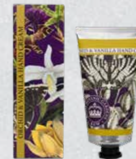
Orchid & Vanilla KGHC0020 **AVAILABLE TO ORDER**