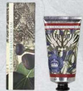
Fig & Grape KGHC0010