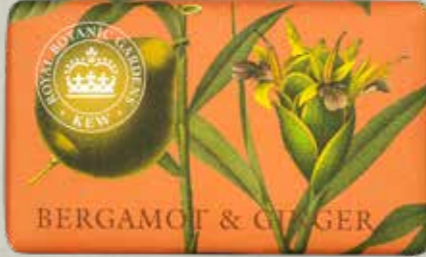
Bergamot & Ginger KGS0008