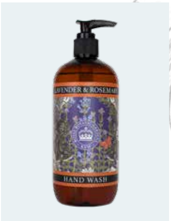
Lavender & Rosemary KGL0001 **AVAILABLE TO ORDER**