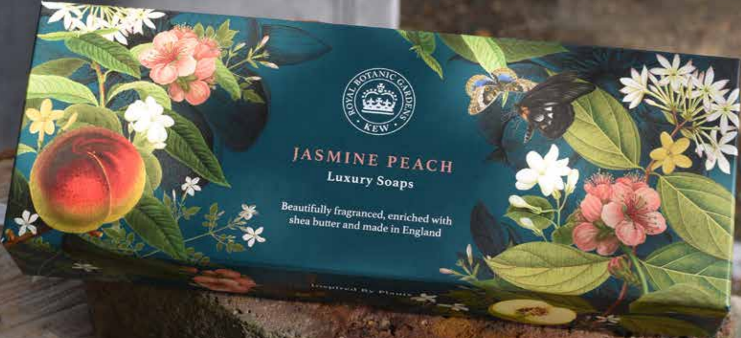
Jasmine Peach KGTS017

A fresh, bright fragrance with Stephanotis jasmine and orange flower, complemented by fruity top notes of wild strawberry, peach, kiwi, and banana.