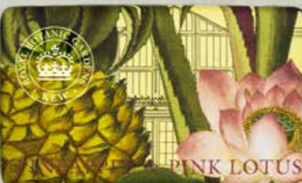
Pineapple & Pink Lotus KGS0014