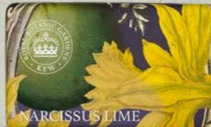
Narcissus Lime KGS0015