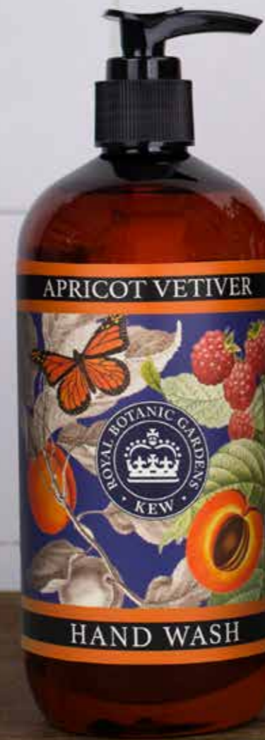
Apricot Vetiver KGL0018 Gardenia & Neroli KGL0019