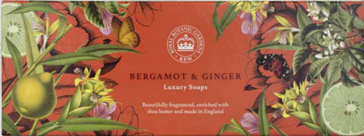
Bergamot & Ginger KGTS008

Top notes of pear combine with heart notes of magnolia, orchid and freesia along with a base of amber and patchouli create this evocative scent.