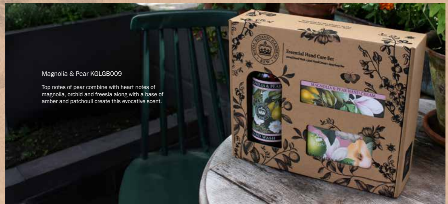
Magnolia & Pear KGLGB009

Top notes of pear combine with heart notes of magnolia, orchid and freesia along with a base of amber and patchouli create this evocative scent.