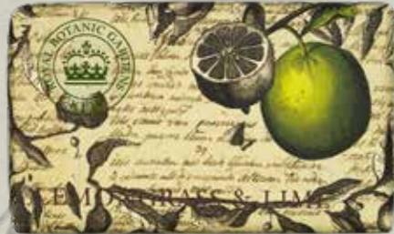
Lemongrass & Lime KGS0004