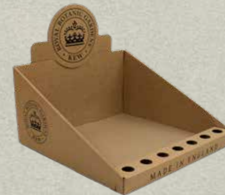
CDU1 HAND CREAM CDU HOLDS 7 CASES