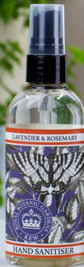
Lavender & Rosemary KGA001