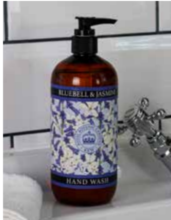
Bluebell & Jasmine KGL0007 **AVAILABLE TO ORDER**