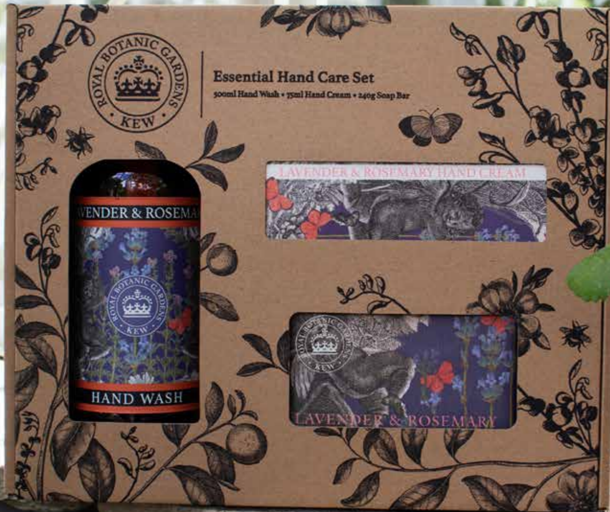
Lavender & Rosemary KGLGB001