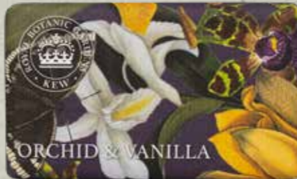
Orchid & Vanilla KGS0020